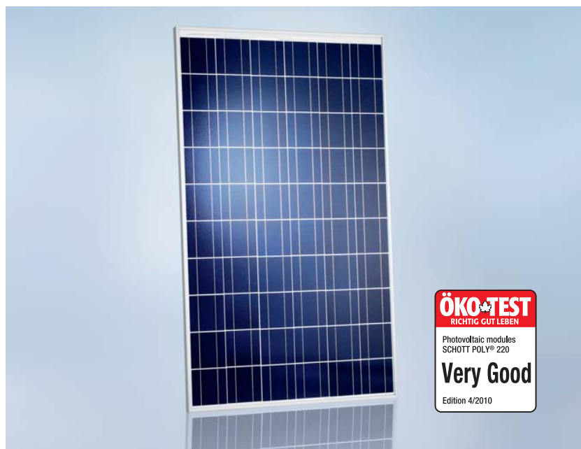
SCHOTT POLY™ 220/225/230/235