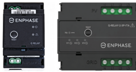
Q-Relay 1P and 3P

Connect PV modules quickly and easily to the IQ7 Series Microinverters that has Integrated MC4 connectors.