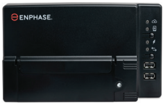
Enphase IQ Gateway

The high-powered smart grid-ready Enphase IQ7 Series Microinverters - IQ7, IQ7+, and IQ7A dramatically simplify the installation process while achieving the highest system performance.