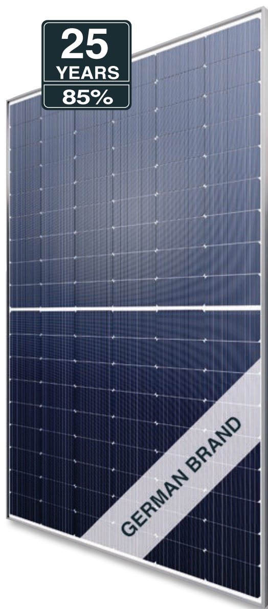
Fig. similar 108MHEN21104A

High quality junction box and connector systems