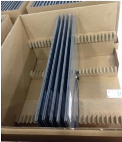
Figure 3: Modules packed for even weight distribution