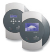
Solar-Log 500/1000™ Data logger