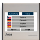
StecaGrid Monitor Data logger