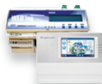
Meteocontrol WEB'log and Meteocontrol WEB'log Comfort Data logger