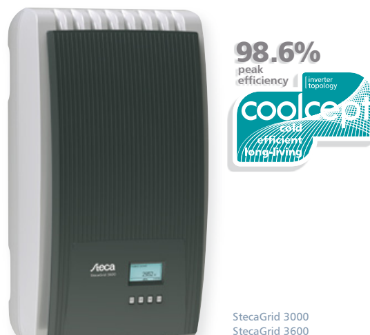
StecaGrid 3000 StecaGrid 3600

The lightweight StecaGrid 3000 and 3600 weigh only 9 kg and can be easily and safely mounted on a wall. The supplied wall bracket and practical recessed grips for right and left handed installers make mounting of the device simple and convenient. The device does not need to be opened for installation. All connections and the DC circuit breaker are externally accessible.